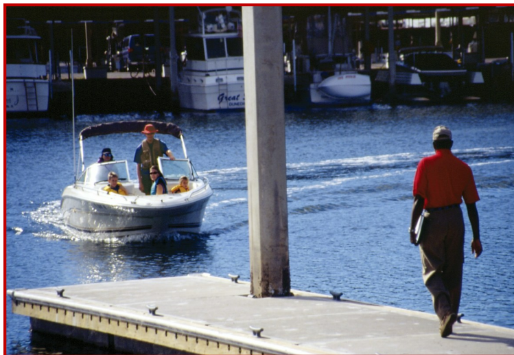
Examiners can conduct the check at the boat owner's location or at a designated site.

The examiner will kindly explain to the boat owner what is missing or incorrect and after the modifications have been made will arrange to re-examine the boat. Again free of charge.